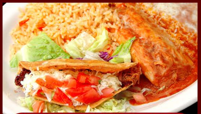
CHEESE ENCHILADA & BEEF TACO

Choice: asada, pollo, carnitas or shredded beef