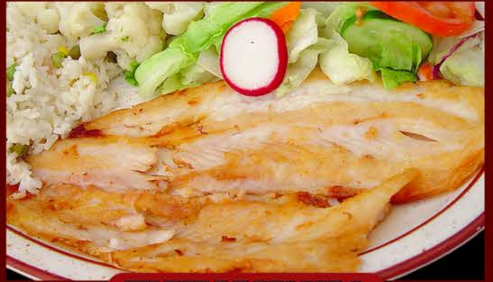
FILETE DE PESCADO