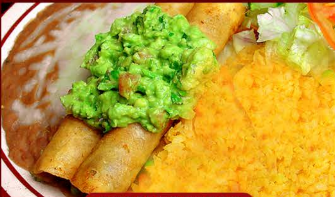
2 ROLLED TACOS

With rice, beans. Your choice of shredded beef or chicken.